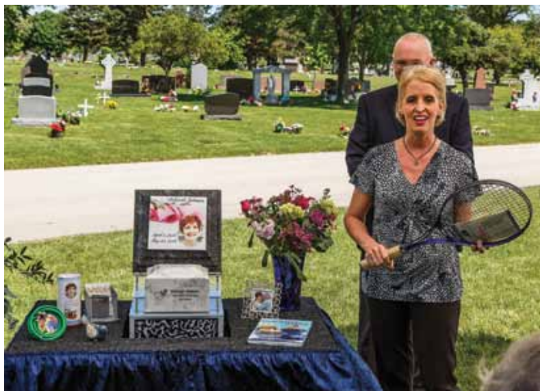
A highly personalized graveside service.

“We never knew we could do this. We took pictures of the vault, we participated, we cried, we