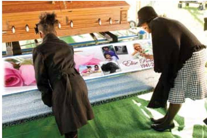
Family members write their own tributes on a highly personalized vault.

Amazing personalization is available on today's burial vaults, and families love it—but they need to know it's available. Funeral professionals who educate families about options are doing the right thing for families as well as the funeral profession.