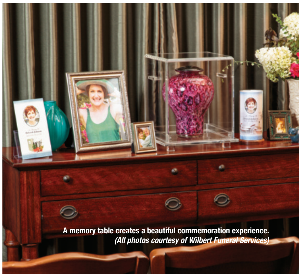
A memory table creates a beautiful commemoration experience.

Don't forget to introduce families to your staff as you are showing them around. From staff receptiveness to facility design, focus on how a family will view your facility as a cremation-oriented memorial center meeting their specific needs.