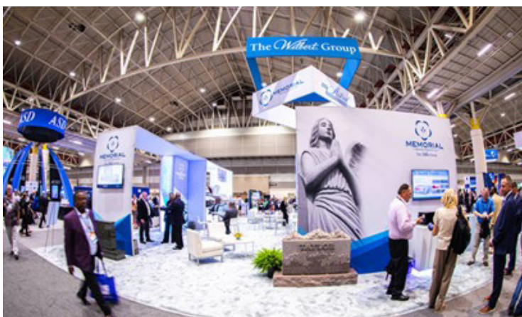
Memorial Monuments booth at NFDA.

At the NFDA convention, Astral Caskets impressed attendees with a thoughtfully curated display of nine premium caskets, showcasing both classic and modern designs. The stainless-steel Golden Fawn garnered significant attention, while the newly introduced Treemont in Ruby Red was warmly received, sparking interest among customers and licensees alike. Visitors eagerly inquired about the upcoming Treemont colors—Emerald Green, Ruby Red, and Purple—demonstrating strong anticipation for our expanding range. Astral's display underscored our dedication to craftsmanship and quality, appealing to diverse preferences and reaffirming our commitment to excellence in funeral services.