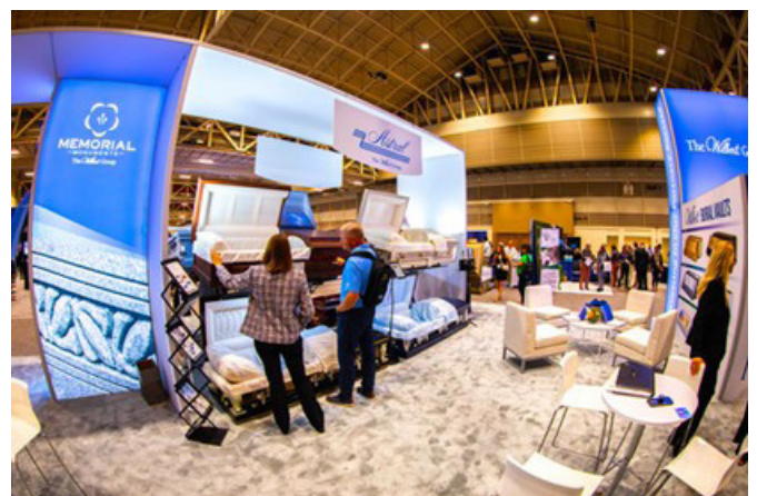
Astral Industries booth at NFDA.