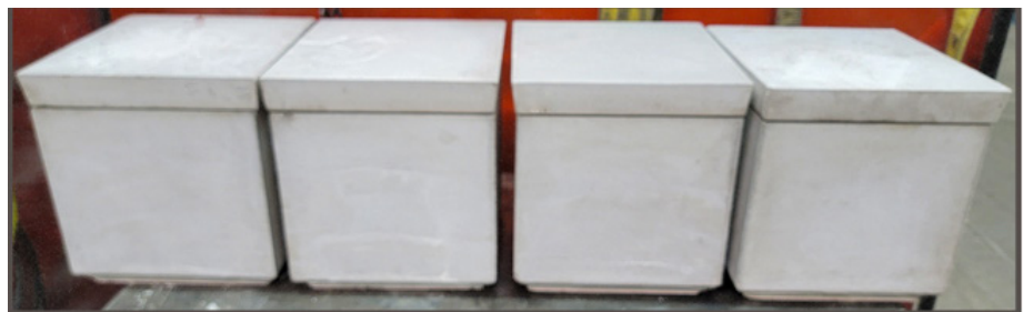
The image above shows the four units produced with one set-up.