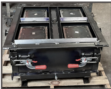
4-Gang urn vault base mold.

If you have difficulties keeping up with production, contact our Broadview office to discuss the urn vault gang form.