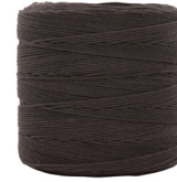
PW0760401 Braided Cotton