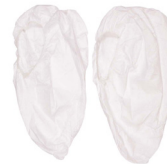
PW0916300 Tyvek 100 pair/box