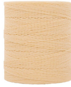
PW0760303 Waxed Linen