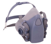
PW0916050 Half Face