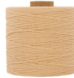
PW0760301 Braided Wax