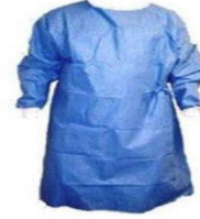
PW0916906 Stay Cool