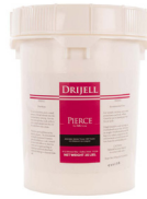
Drijel PW0702300 25 lbs.