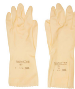
PW0761000 Autopsy Gloves Box of 1 dozen