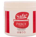
Safe PW0460800 1 lb. Wide-Mouth Jar