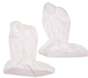
PW0916302 PCV Sole 100 pair/box