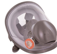
PW0916060 Full Face