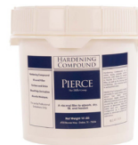
Hardening Compound PW0403600 15 lbs.