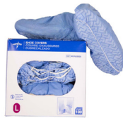
PW0916301 Non-Skid 100 pair/box