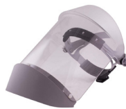
PW0916207 Face Shield