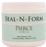
Seal-n-Form PW0465000 1 lb.